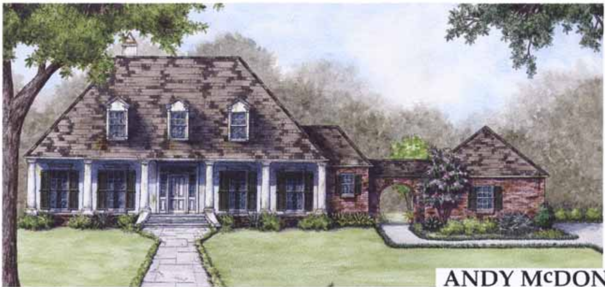
96'-9" x 56'-3"